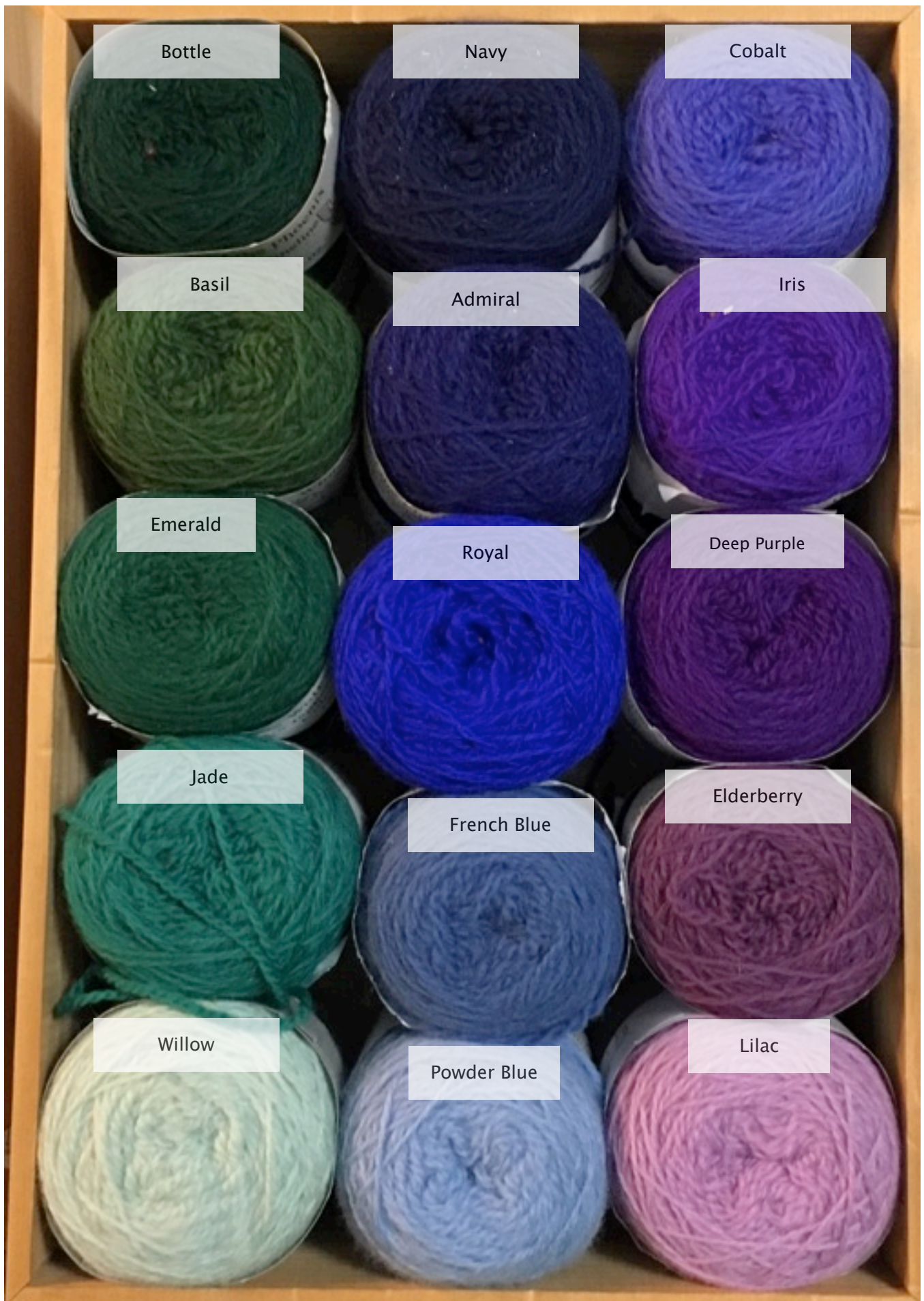
Maineline Wool (2/8 pictured and 2/20)