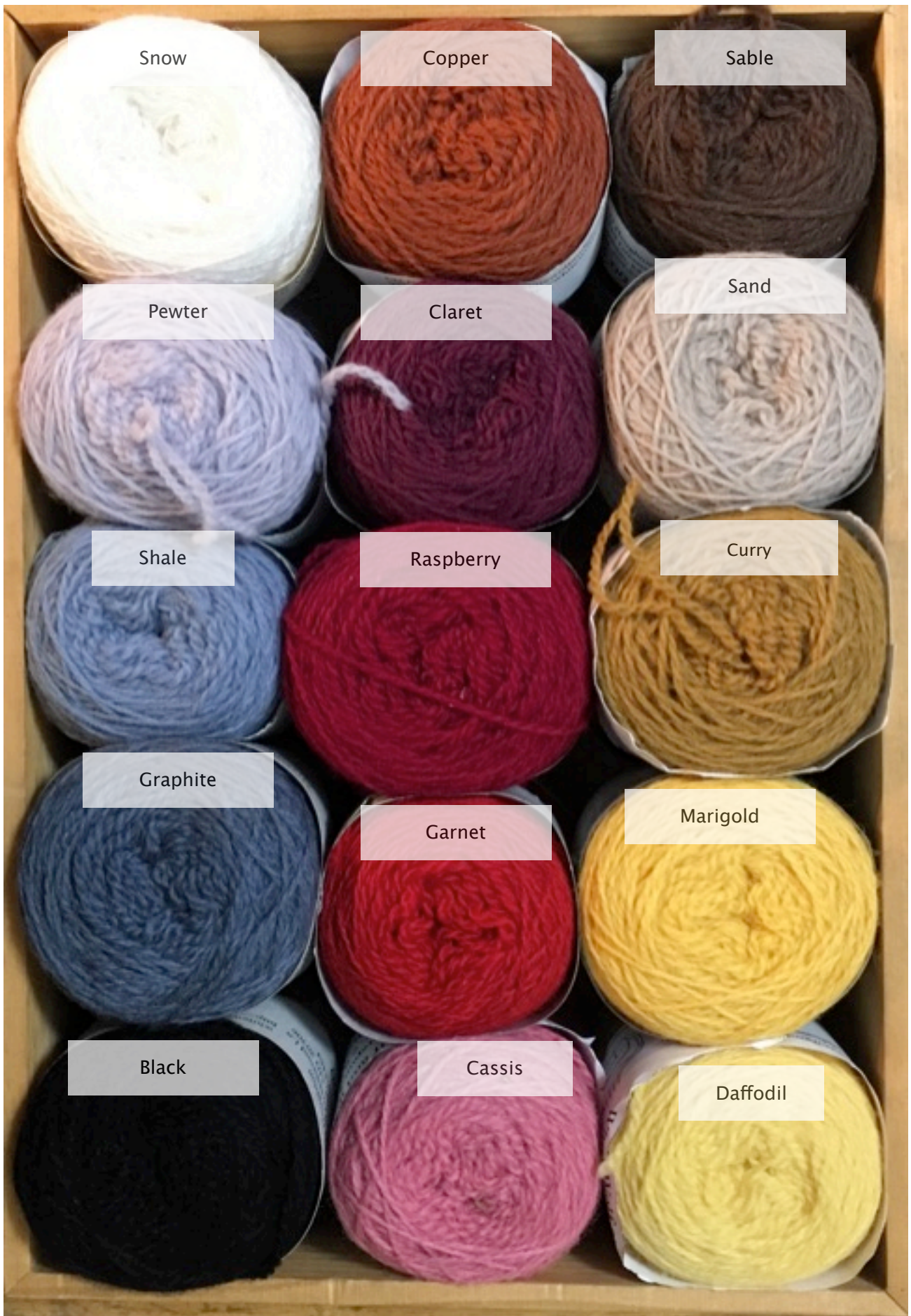
Maineline Wool (2/8 pictured and 2/20)